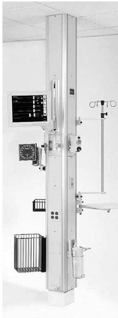
9" x 9" Open Access Column Model 5701