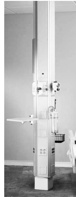
5-Sided Open Access Column Model 5706